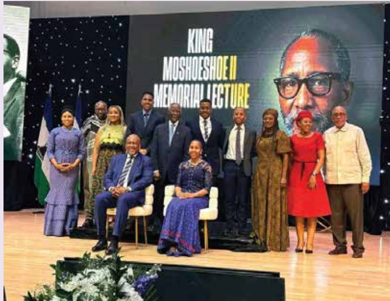
Commemoration of 30th anniversary of King Moshoeshoe II Demise