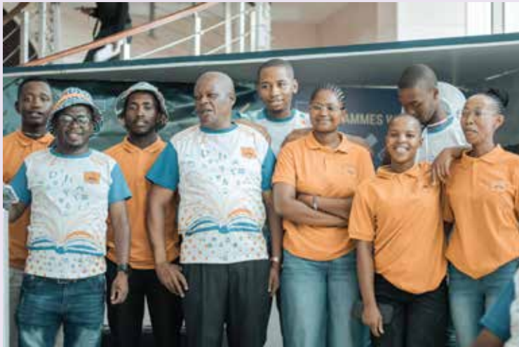
LCE team demonstrating creativity, teamwork and excellence

A number of important engagements remain outstanding and will be prioritised in the coming weeks. These include courtesy meetings with the Minister of Education and the Minister of Finance, as well as a courtesy meeting with His Majesty the King. Engagement with the Chancellor and meetings with other key stakeholders are also planned. These engagements are considered essential for strengthening partnerships and enhancing institutional support.