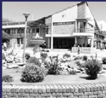
Lesotho College of Education- a hub of learning and innovation.