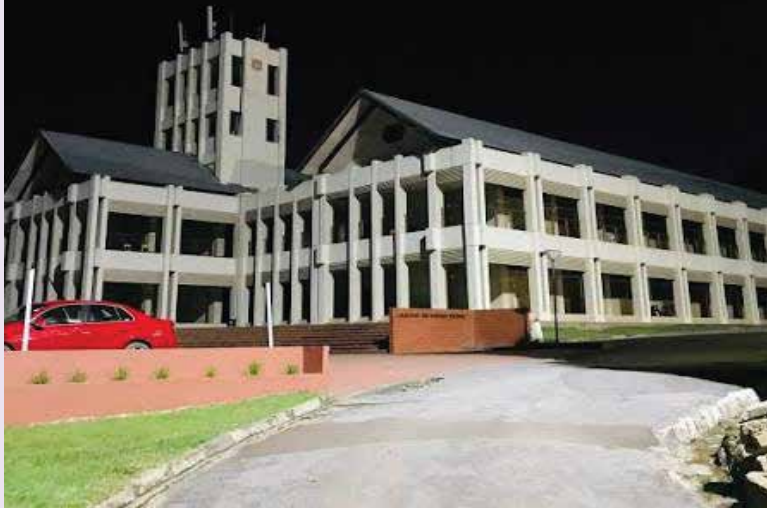
Campus View: Strengthening foundations for future expansion. Japan building in campus.